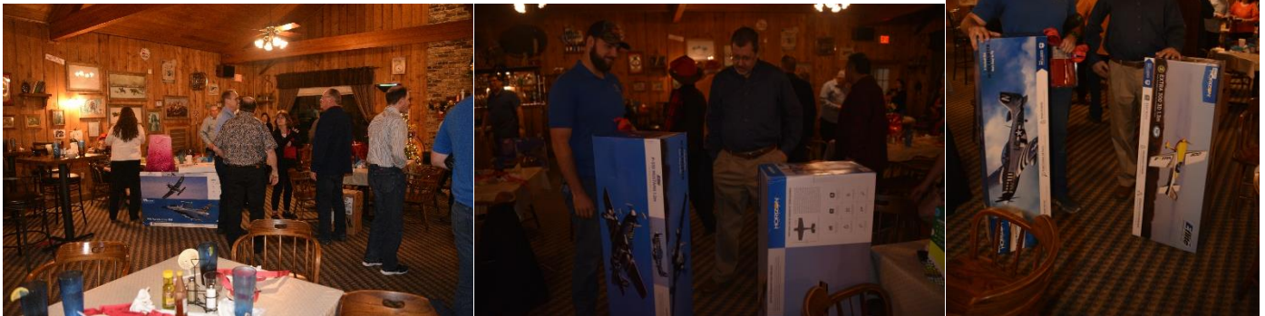
ARCS Meeting Minutes November 20, 2022

Meeting called to order at 7:00 with Pledge of Allegiance. Good attendance