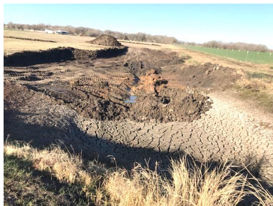
4 Much bigger pond now.