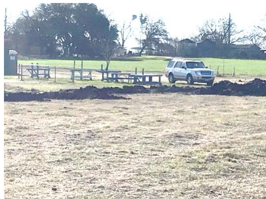
2 Another view of the new pipeline installation.