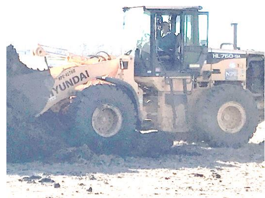
3 Some serious heavy equipment for digging

Upcoming Events: RC SWAP MEET 20 FEB 2021 0900 - ???5504 Schertz Road, San Antonio, TX