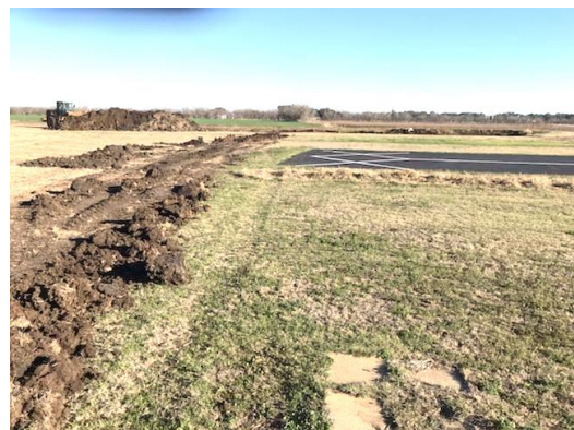
1 Pipe is in, the dirt needs to be rolled and raked and grass planted.

The previous weekend the field was closed while Joe plowed up the ditch off the end of the runway and laid in the irrigation pipe he had stored next to the storage sheds. Joe also dug out the pond, almost doubling it in size. When filled it will make a good place for flying float planes. The area off the west end of the runway will have to be rolled and raked, but when done it will eliminate the landing-gear eating ditch and allow for an overrun area for guys landing long from the east.