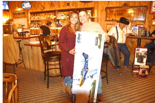
6 Happy hubby, happy wife