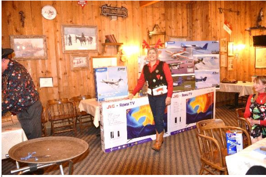
3 Big Screen TV winner!