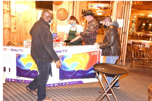
7 Hauling away the TV