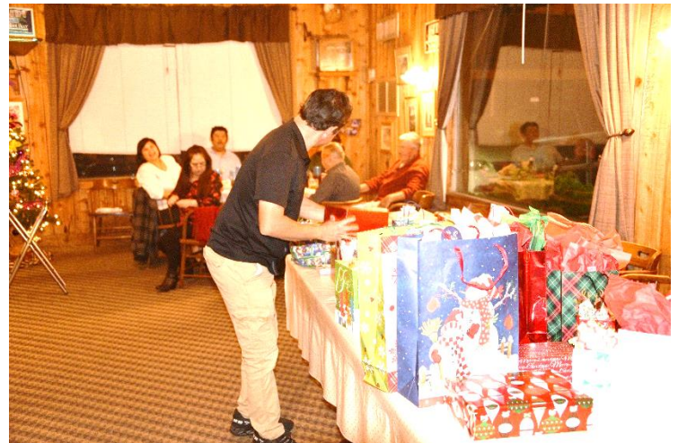
The gift exchange table was full too