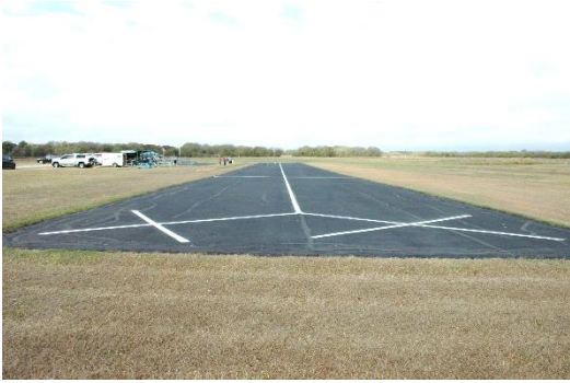
11Newly Surfaced Runway