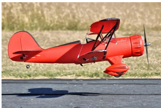
A red WACO bipe