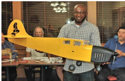
The Balsa USA Trainer