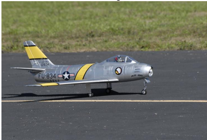
Phil Everman's F-86 ready for a sortie