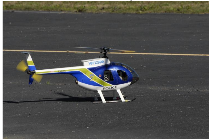
and his new Electric police chopper