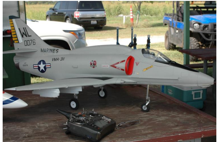
Pete Dubree's A-4 Skyhawk