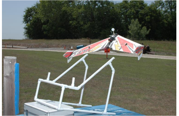
Harold Sauls flying wing ready for launch