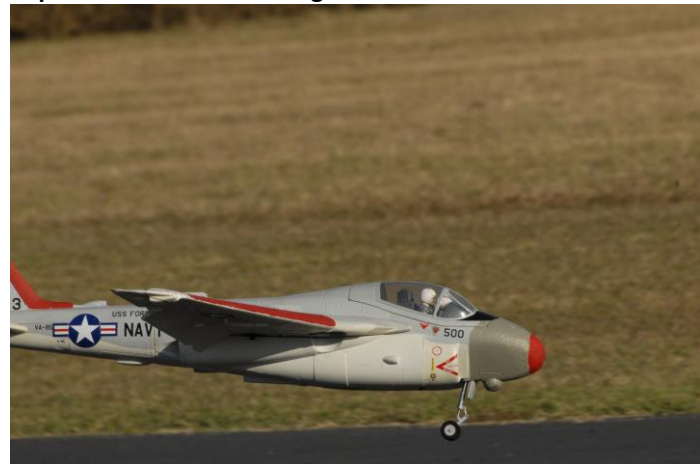
Pete Dubree's A-6 Intruder "Mayday stuck nose gear"