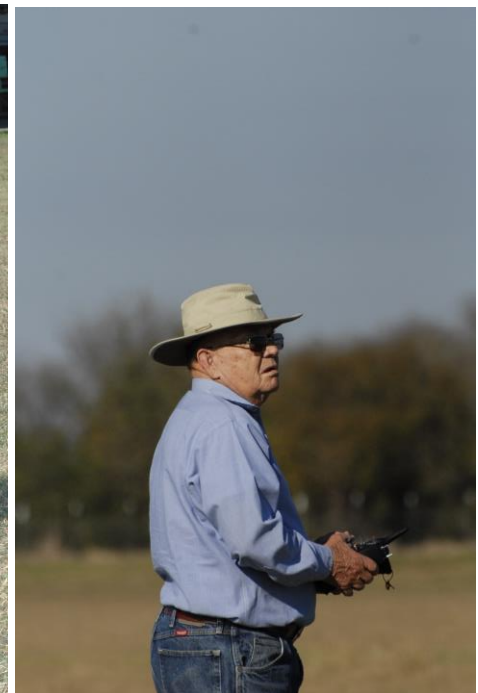
Recent new club members