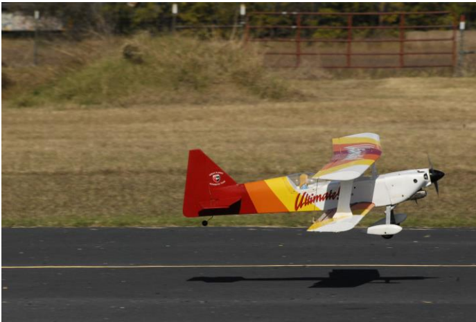
Jim Agnew's nice Ultimate Biplane